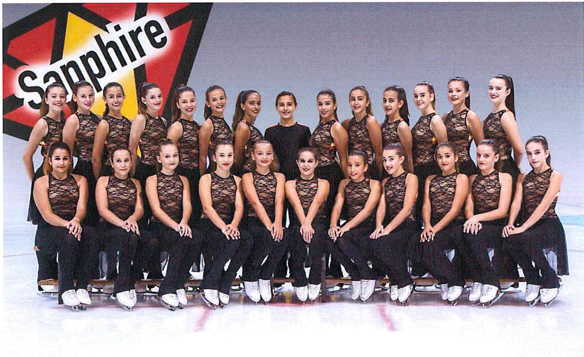
Team Sapphire – Spain