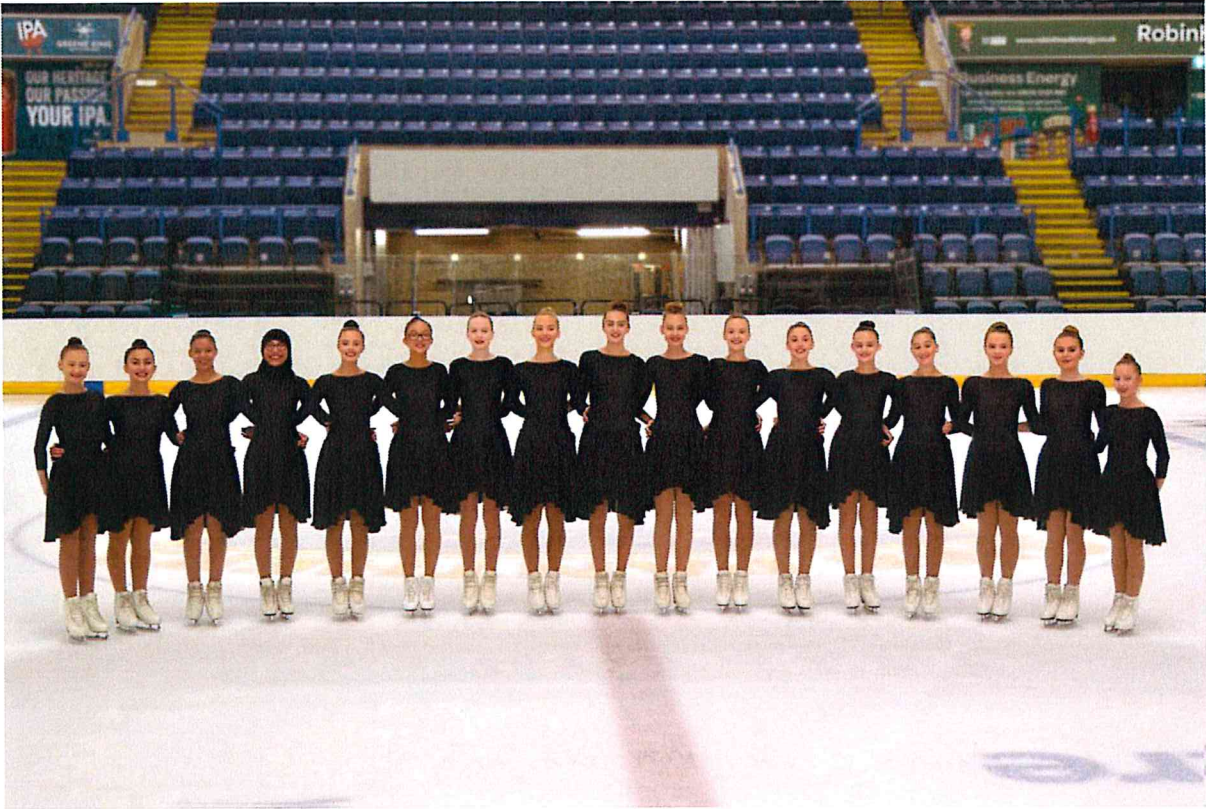
Team Shadows – Great Britain