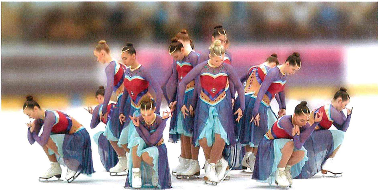
Team Icicles – Great Britain