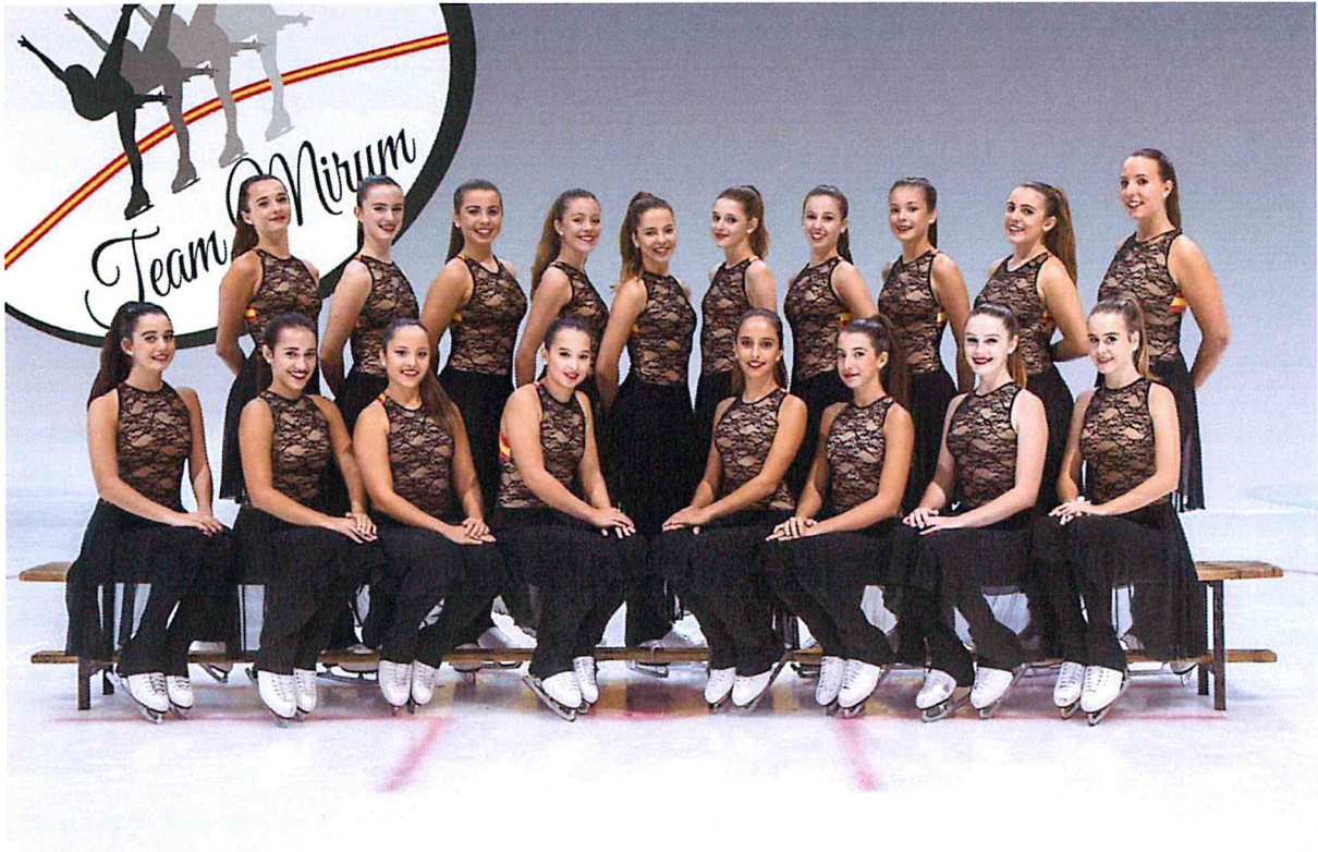
Team Mirum – Spain